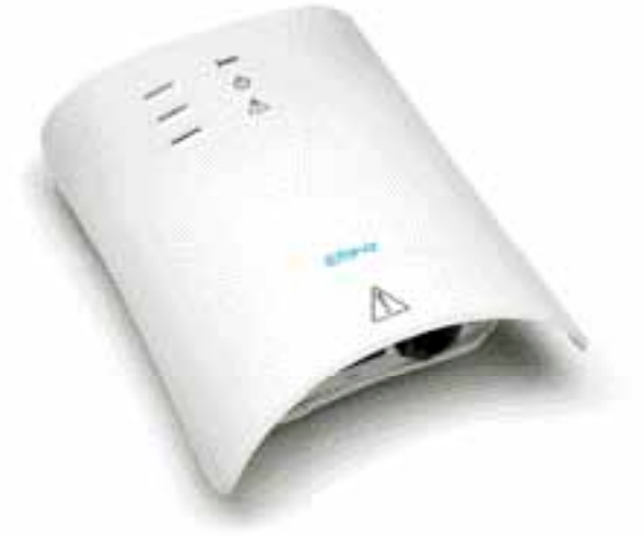
Bed-Occupancy Monitor D-1070-2G

SafeBed operates with 2 pcs 1.5 V AA size alkaline batteries. Optionally a medical grade AC adapter is available.