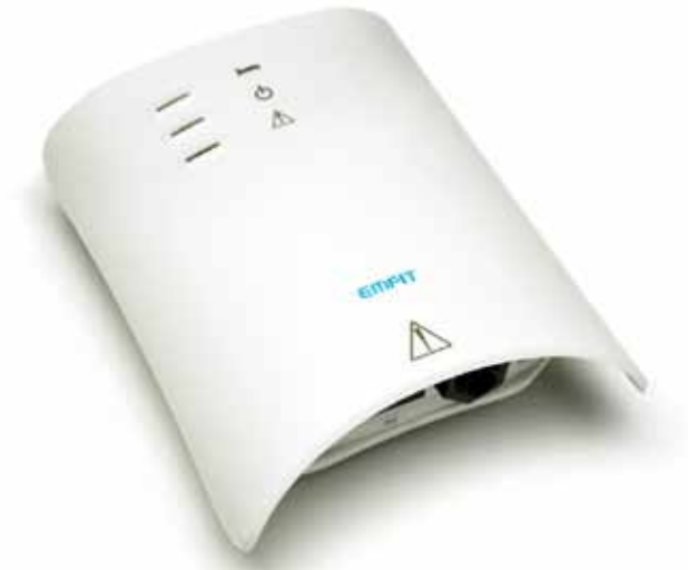
Emfit Movement Monitor D-2090

The Emfit Movement Monitor operates with 2 pcs 1.5 V AA size alkaline batteries. Optionally a medical grade AC adapter is available.